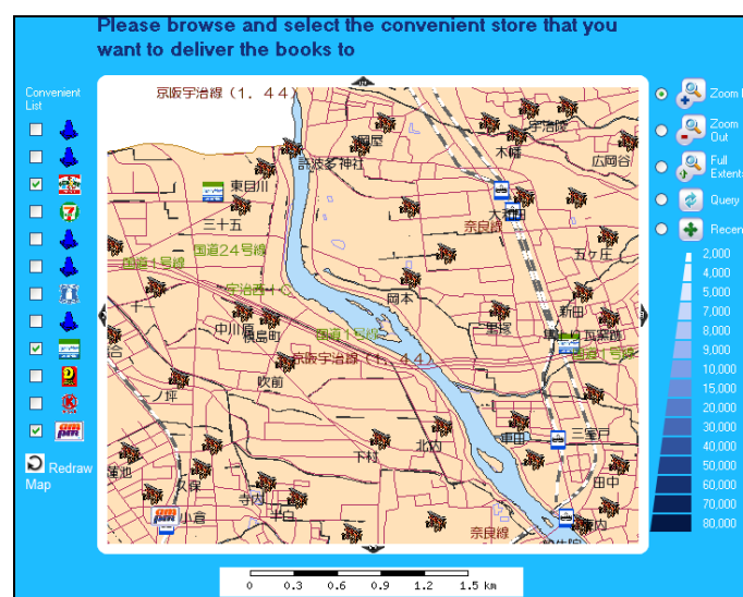
Figure 5: Specify the nearest convenience store on the map

This page's content will then be sent as a HTML email to the administrator of the library. The order will then be carried out as in library's standard book lending procedures.